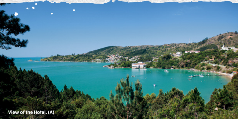
View of the Hotel. (A)