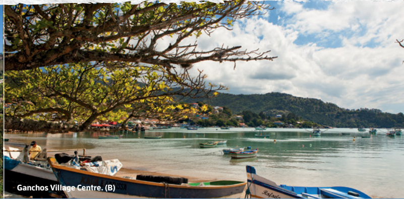
Ganchos Village Centre. (B)